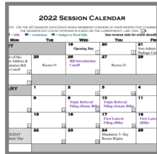
Ask for a Hearing