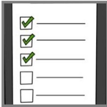
Find the Bills